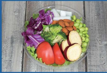
BERRA FOR VEGAN

MIXED LETTUCE / TOMATO / EDAMAME / SWEET POTATO / JAPANESE RADISH / BROCCOLI / RED CABBAGE / ALMONDS